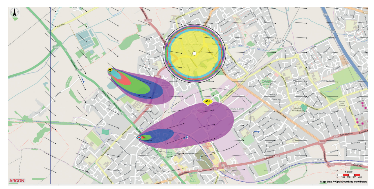
PlumeSIM supports single of multilple simulated threat releases.