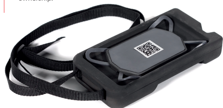
MultiGAS-SIM simulator module for use with Android mobile.

The MultiGAS-SIM is very easy to use, does not require any regular calibration or preventative maintenance, except to readily available commercial AA batteries, and has no consumables resulting in meager ongoing "whole life" cost of ownership.