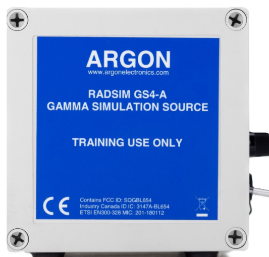
RadSim-GS4 simulation Gamma source

Simulated sensitivity enables the Tracerco™ PED+ SIM to detect the Radsim GS4 simulation Gamma source at a free space distance of typically 200 feet (60 metres) distance line of sight.