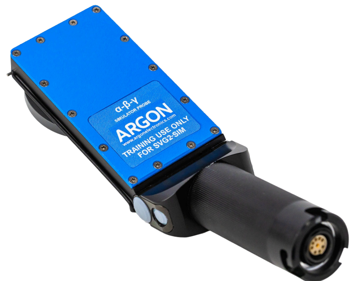
SVG-2 Alpha, Beta, Gamma Simulation Probe