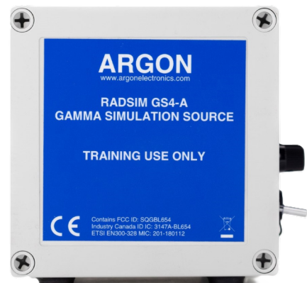
RadSim-GS4 simulation Gamma source

The RadEye™ GF-10-SIM is compact sized for performing one-handed measurements, even when wearing gloves. The user-friendly interface utilizes two display screens (one large front case display and a smaller top display) and five buttons.