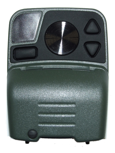
ChemPro100-SIM responds to Long Range Vapour Source simulators.

ChemPro100-SIM works on all the same battery types as the real detector. ChemPro100-SIM requires no preventative maintenance and spares are minimized to reduce the cost of ownership. Expensive damage to real detectors is avoided which means operational readiness is maintained.