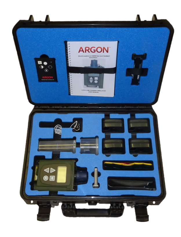
M4 A1 JCAD-SIM is supplied complete with simulation accessories for comprehensive training

M4 A1 JCAD-SIM works on the same commercial battery supply as the real detector. It requires no preventative maintenance and spares are minimized to reduce the cost of ownership. Expensive damage to real detectors is avoided which means operational readiness is maintained.