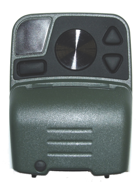
M4 A1 JCAD-SIM responds to Long Range Vapour Source simulators

You no longer need to use simulants that could harm the environment, saturate training spaces, or create health and safety risks for instructors and students. Training sources can be deployed anywhere, including inside public buildings. Most scenarios can be set up in less than ten minutes and because you control the sources, your scenario will not have changed when it is time for the exercise. The M4 A1 JCAD-SIM is fully compatible with the Argon PlumeSIM system for instrumented collective wide area field exercise and table-top CBRN training.