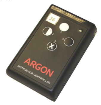
Instructor Remote Controller

Argon simulation systems enable realistic simultaneous training in the use of detection instruments that work on different technology principles. M4 A1 JCAD-SIM is compatible with other simulators manufactured by Argon Electronics, including AP4C-SIM, CAMSIM, and RAID-M100-SIM, permitting multi detector, multi substance training to take place within the same training scenario. The electronic simulation sources can represent false positives, as well as, chemical warfare (CW) agents and toxic industrial chemicals (TICs), enabling the M4 A1 JCAD's appearance and functions to be accurately replicated in a safe, practical manner. For further information on training with multiple simulators a white paper can be downloaded from our website.