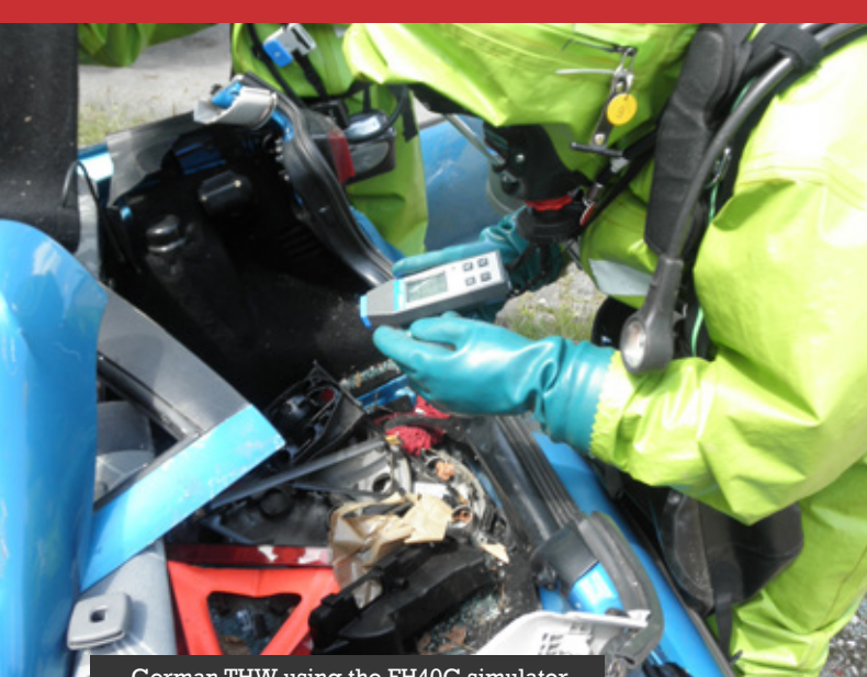
German THW using the FH40G simulator

Jarch 2011: the tsunami that followed the Tohuku earthquake disabled the generators that would have powered the cooling system pumps at the Fukushima-Daiichi nuclear power plant in Okuma, resulting in catastrophic failure and subsequent release