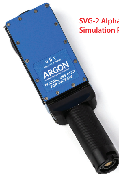
SVG-2 Alpha, Beta, Gamma Simulation Probe

SVG-2 SIM permits radiological instructors to safely teach critical search, reconnaissance, survey and location skills as well as a practical understanding of inverse square law, isodose rate mapping, shielding and safe demarcation. The SVG-2 SIM receives encoded signals representing specific beta/gamma radionuclides from deployed electronic simulation sources or PlumeSIM, and with the simulated external Alpha, Beta, Gamma probe you can carry out both survey, contamination monitoring and decontamination exercises.