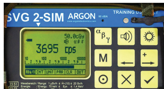
Simulation Alpha, Beta Gamma probe responding to safe sources.